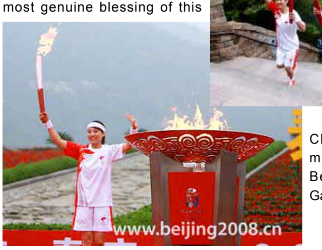
China's famous mountain to Beijing Olympic Games.

in the bid for the 29th Olympic Games and the Olympic flame atop Mt. Taishan now offered the most genuine blessing of this