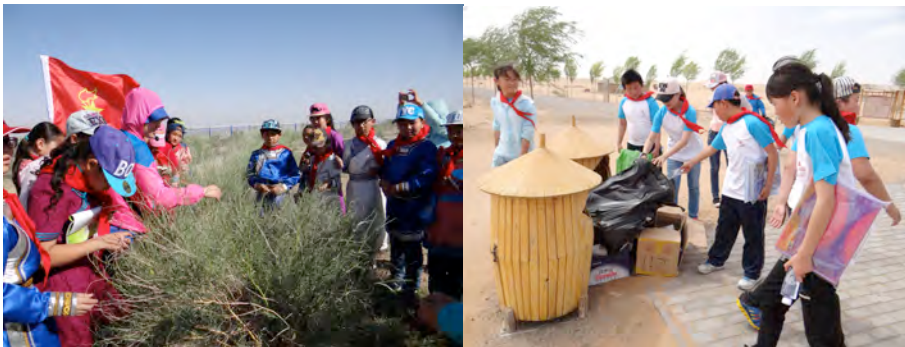
Hold a summer camp with primary school to get geoknowledge about desert forming , desert plants and the environment protection at the edge of desert.