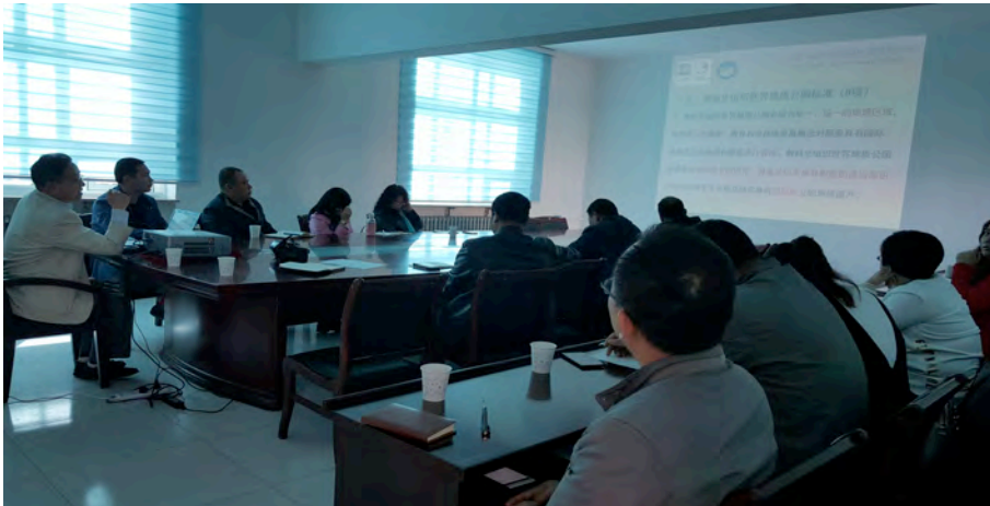
Take a training course among the local related staffs in Alxa Desert Global Geopark after participating in Beijing Global Geopark Management Training Course