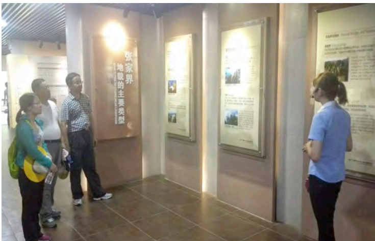
Visiting sisterpark Zhangjiajie Geopark and study the experience each other.